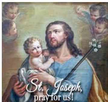
St. Joseph, Spouse of the Blessed Virgin Mary Feast Day: March 20, 2023