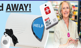
This Button SAVES Lives! As Shown GPS, Lowest Price Guaranteed!