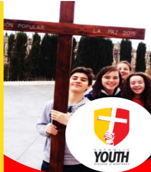
Catholic Youth Diocese of Monterey

Be a Parish leaders who will start a youth ministry initiative in their churches. They must be recommended by their pastors.