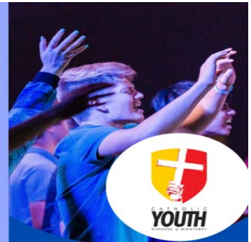
Catholic Youth Diocese of Monterey

Be a Parish leaders who will start a youth ministry initiative in their churches. They must be recommended by their pastors.